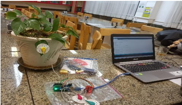
Figure 1: The experimental set up utilized for capturing plant electrophysiological signals

A Python Heart Rate Monitor (A software-based application that can be used to analyze and visualize the electrical signals obtained from an ECG system) with a GUI (A type of user interface that allows for the interactive visualization and analysis of data) was used for processing the captured data. This Python program implements a heart rate monitor application using the Tkinter library (A popular Python library for creating high-quality, publication-ready graphs and visualizations) for a graphical user interface (GUI). It reads serial data from a COM port, processes it, and displays live electrocardiogram (ECG) data on a matplotlib graph (A popular Python library for creating high-quality, publication-ready graphs and visualizations).