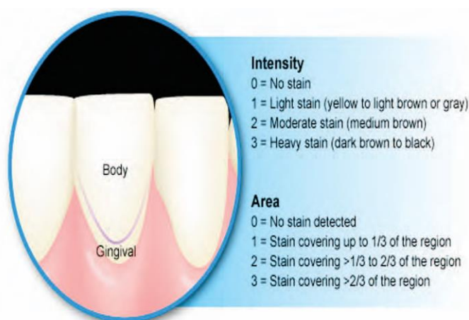
Figure 3. Distribution of color intensity and extent according to Lobene color index

The staining extent was categorized as score 0 = no stain (color has not covered an area), 1 = stain over a third of the region, 2 = stain over two thirds of the region, and 3 = stain over more than two-thirds of the region. (Figure 3)