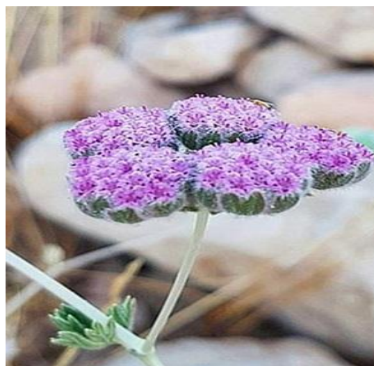
Figure 1: O. decumbens Vent plant

In this study, the medicinal plant O. decumbens Vent (Figure 1) is prepared from Zarrinabad area of Dehloran city in Ilam province (Table 1). Identification and approval of plant species were done based on the Atlas of Plant Flora of Ilam Province (Dr. Valiollah Mozafarian).